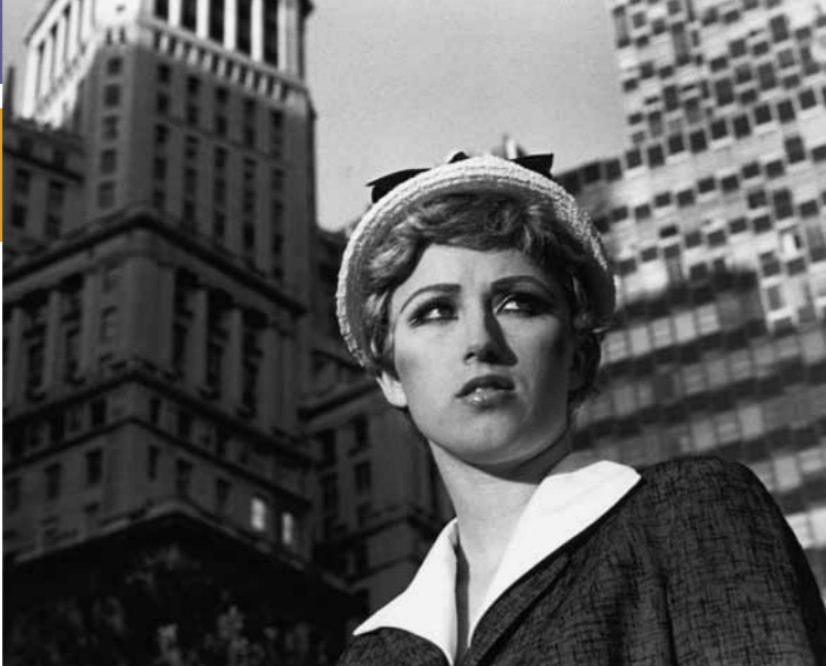
Cindy Sherman. American, born 1954, Untitled Film Still #21 , 1978, Gelatin silver print, 7 1/2 x 9 1/2 (19.1 x 24.1 cm), The Museum of Modern Art, New York. Horace W. Goldsmith Fund through Robert B. Menschel, © 2009 Cindy Sherman