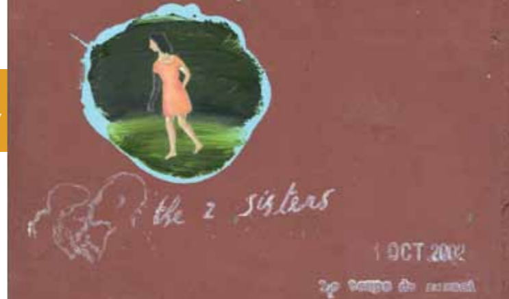
Francis Alÿs, Le Temps du Sommeil , 1996 – present, series of 100 paintings (ongoing), oil and pencil on wood, 12 x 16 cm

the 20 th -century. In 1967 he curated Six Painters which included work by Piet Mondrian, Philip Guston, Franz Kline, Willem de Kooning, Jackson Pollock and Mark Rothko. Vertical Thoughts takes its inspiration from Feldman's original project; the exhibition comprises music scores, record covers, photographs, and works from Feldman's own Collection, including a number of oriental rugs. Also presented is a programme of related events, including a concert of Feldman's music.