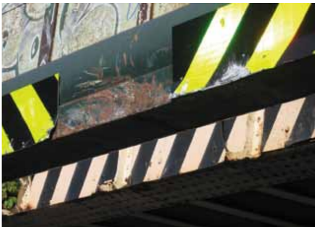
Anne Tallentire, Nowhere else , 2010, digitally interactive double screen video projection, wall chart, chart for distribution (detail projected image no. 02 february. 11 _geofish_-_capricornus_11atchmere, 240cm x 180cm), Courtesy of the artist

A fully-illustrated publication accompanies this exhibition.