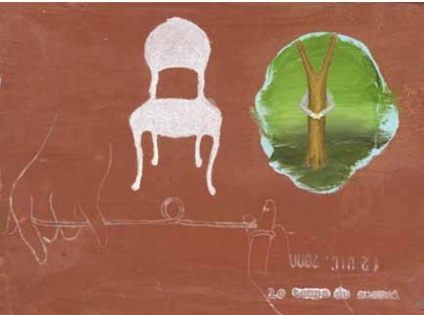
Francis Alÿs, Le Temps du Sommeil , 1996 – present, finite series of 111 paintings, the dates stamped on each painting indicate the different stages of retouching, oil, encaustic, crayon and collage on wood

East Wing, Ground Floor Galleries Until 23 May Admission Free