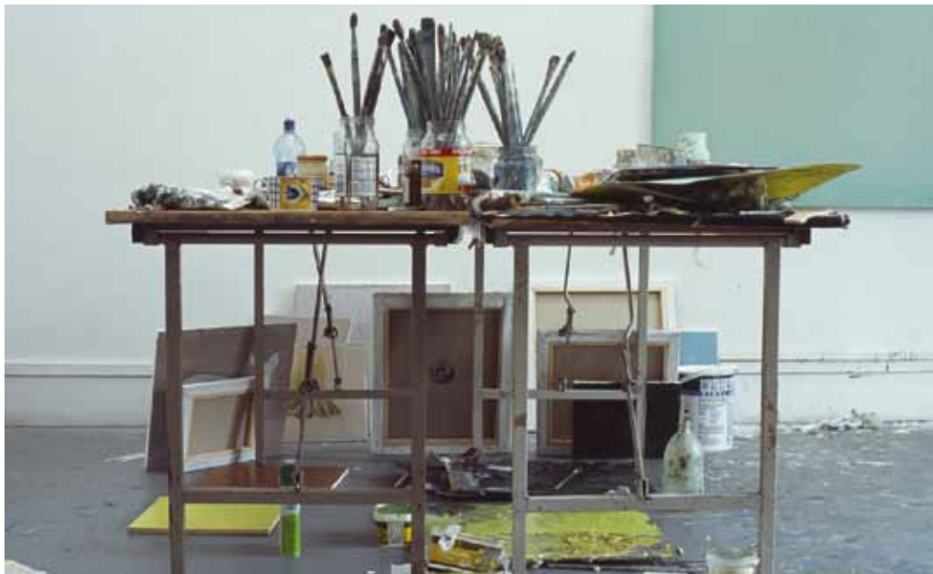
Studio 14, Artists' Residency Programme