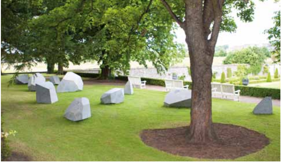
Iran do Espírito Santo, Untitled / Corrections D , 2008, Granite, Dimensions variable, Collection Irish Museum of Modern Art, Purchase, 2007